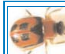
Look For The Black Triangle Behind The Head To Identify The Bean Leaf Beetle

As for soybeans, any seed beans that are to be returned much be brought back to us by June 15th for credit to be given.